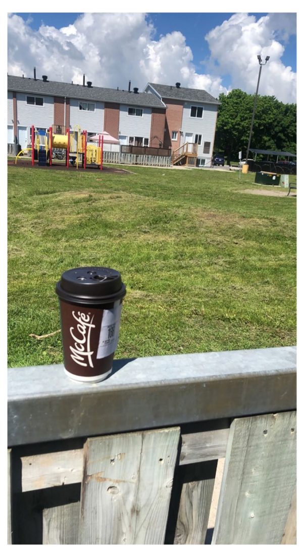
Fig. 1 Social support networks

"I know if I was to run inside while my sons outside, he'd be 100% taken [care of] and looked after by people in the neighbourhood." (Family 003)