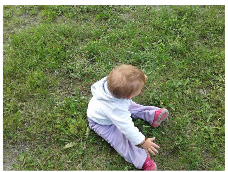
Fig. 3 Access and connection to nature

Families noted that nature proved healing for both parents and children alike. Parents highlighted how the outdoors offered a way for their children to expend energy and express themselves as loudly as they desired. Others noted the calming effect that nature had on their children's demeanor. One family considered moving closer to nature after noticing a drastic change in their daughter's emotions when spending time in the countryside (Fig. 3):