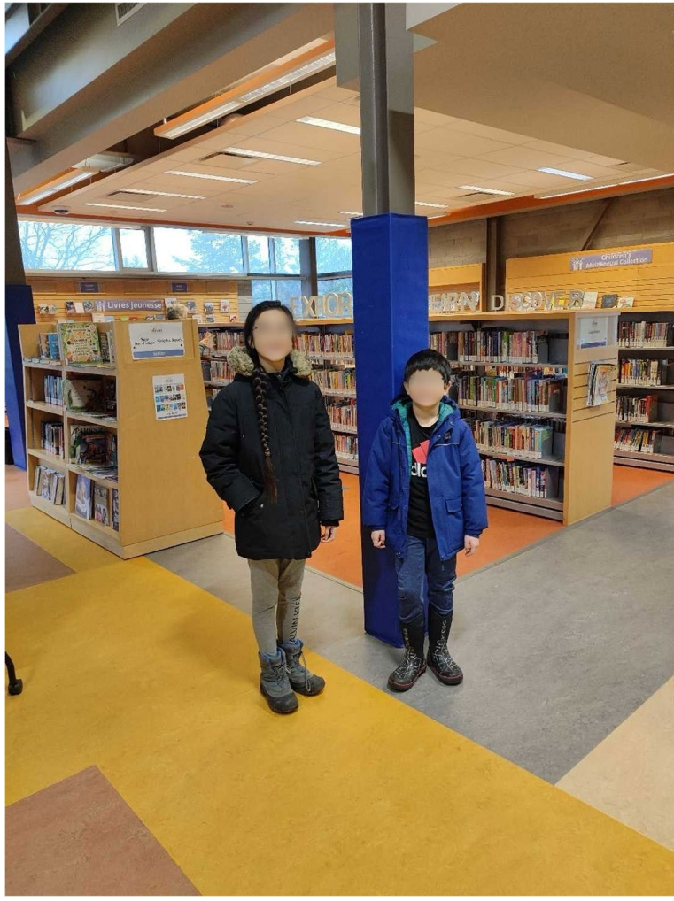
Fig. 5 Access to social services and community resources

"For families like us with very limited resources, we don't have the budget to buy books from the bookstore or, you know, [name of store] all the time. So, the library is really vital [...] And not only for entertaining but also for education [...] I didn't grow up in an English-speaking country. And the books that I read may not be suitable for the children here [...] I didn't know how to help my children to get inte-