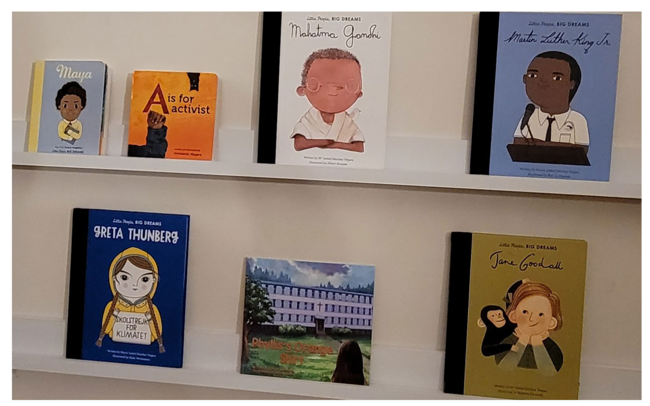
Fig. 2 Factors fostering children's development

Likewise, ensuring that children were healthy helped families thrive in the face of adversity. For Family 047, an accurate mental health diagnosis for her daughter not only aided in explaining health concerns, but also ensured that she was receiving the appropriate