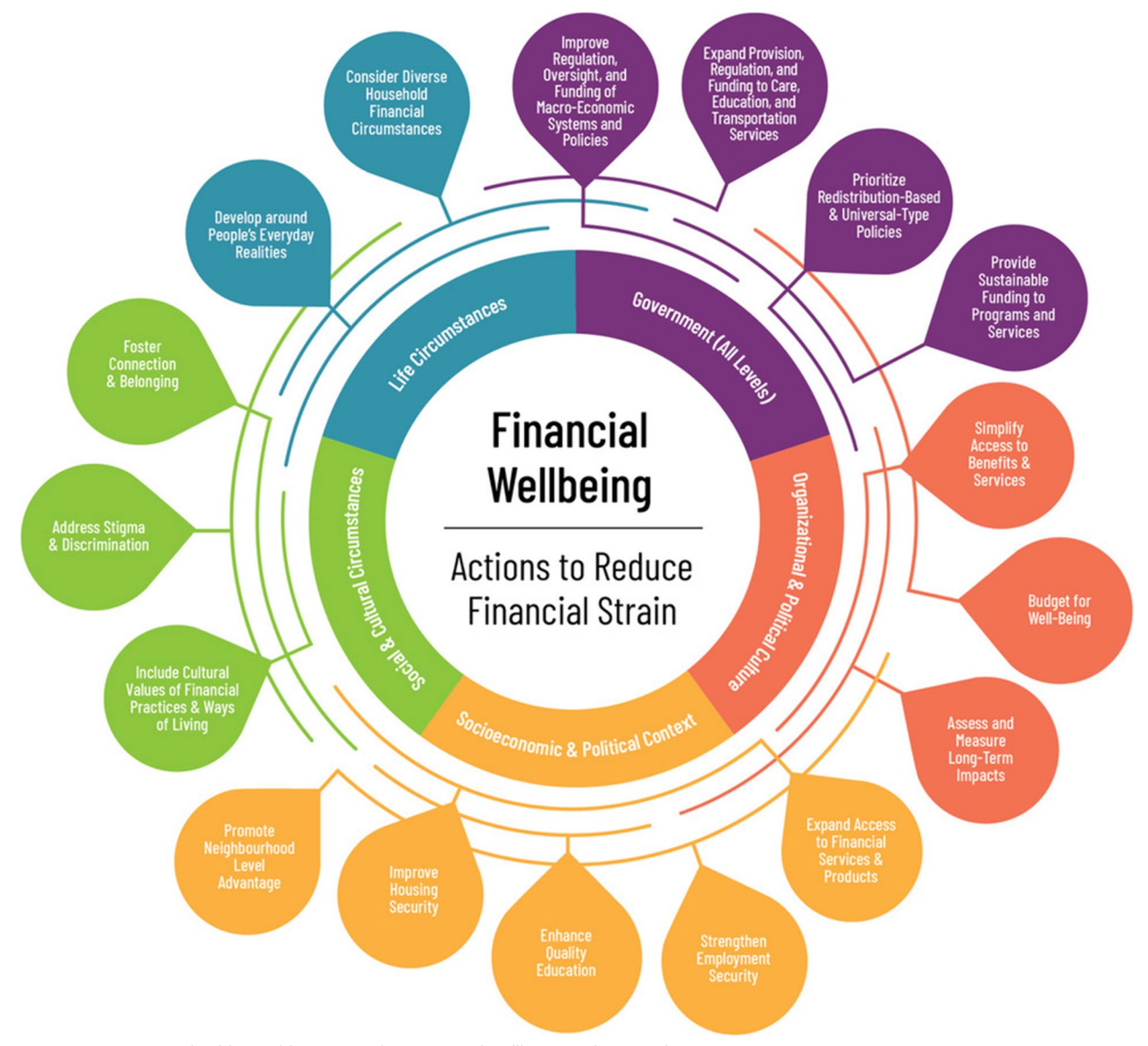
Fig. 2 Action-Oriented Public Health Framework on Financial Wellbeing and Financial Strain

Government (All Levels) domain is meant only for the public sector, including municipal, state/provincial/territorial, and federal governments. The other four domains present actions that can be undertaken by either governments or organizations. In total, there are 17 different, but interconnected entry points for action linked to the domains. The entry points indicate what to do in each domain. For instance, organizations and governments designing, delivering, and/or assessing (evaluating) initiatives related to Organizational and Political Culture domain should seek to 'Simplify Access to Benefits & Services', 'Budget for Wellbeing', and 'Assess and Measure