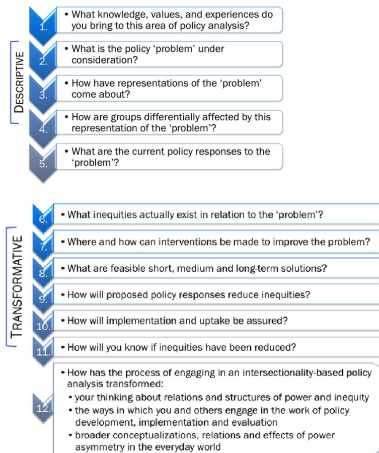
Figure 2 Descriptive & transformative overarching questions of IBPA.